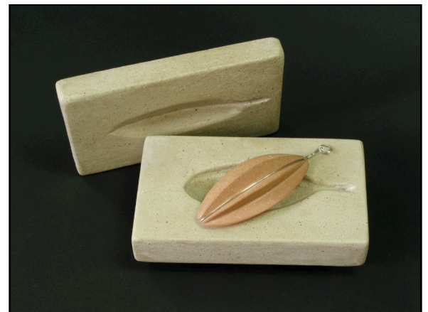
Pendant with its own concrete container. (Not for sale.)

Three-groove concrete pendants, both with sterling chains (24"). Large is about 2 1/2" long, small is about 1 7/8". One has a red pigment added to the white Portland cement. The chain goes through a loop attached to a silver strip which runs down the back. A silver wire holds the concrete in place against the strip. I have done these in colours ranging from white through black, and also with silver filings added to the mix. Price range is about $200 to $250 (box not included).