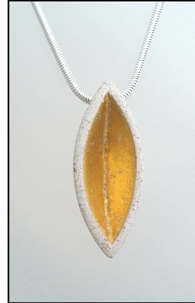
Small variation, 1 3/4", $175.

Concrete pendants, two with gold leaf, all with sterling chains (24"). Each is about 2 3/4" long, and about 1/2" thick. The chain goes through a drilled hole in the concrete. I do these with a smooth concave surface (left), or a V-groove like a boat (center and right). $200 each.